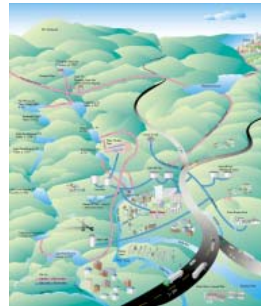
Fresh Water Mural

The Fresh Water Acquisition & Distribution Mural represents an aerial view of the sources of water supplying the city of Worcester. It is 60" X 72" and is installed above the drinking fountain.